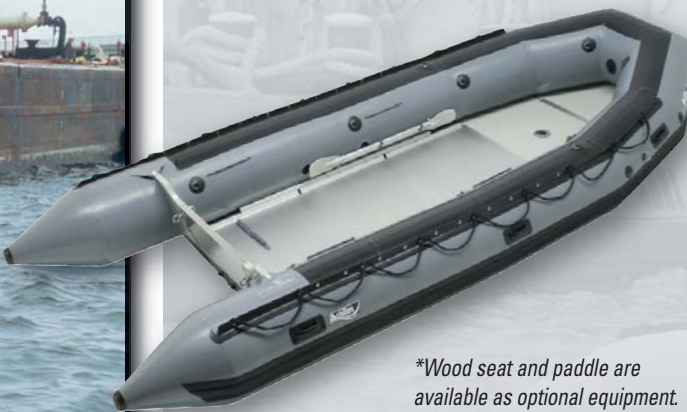
*Wood seat and paddle are available as optional equipment.

Hypalon/Neoprene fabric; toughest double layer (840 denier each) nylon core fabric; trigon air keel; aluminum & fiberglass self-locking self-locking floorboards & stringer system; fiberglass-encased transom with aluminum plate & motor pad; fuel tank tie-down; large self-bailer; extra-wide, heavy-duty, full-length teardrop rubbing strake; tie-down straps for paddles; bow handle; towing bridle D-rings; lift & carry handles; splash guard with life lines; heavy-duty reinforced cargo wear patch all around; extra tie-down D-rings; heavy duty recessed valves; two (2) high-volume large foot pumps; and maintenance kit.