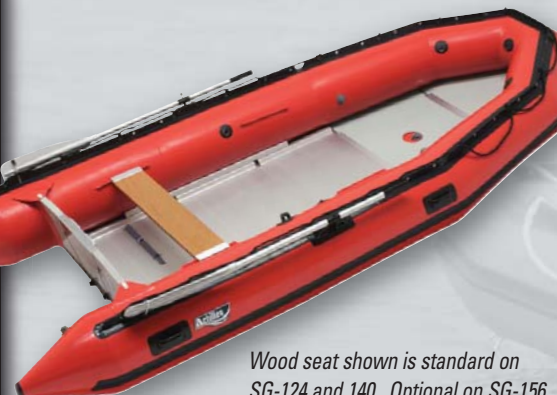
Wood seat shown is standard on SG-124 and 140. Optional on SG-156.

These rugged models offer both the room and performance to fill a range of needs. Their size allows them to carry a fully equipped team of divers or rescue personnel for any situation. Their tough Hypalon® fabric and aluminum floor systems stand up to all types of heavy use. A deep "V" trigon air keel insures better tracking and performance when speed is of the essence.